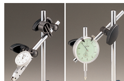
The dial gage is not included.